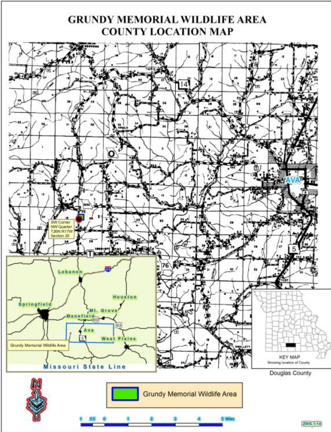
Figure 1: County Location Map